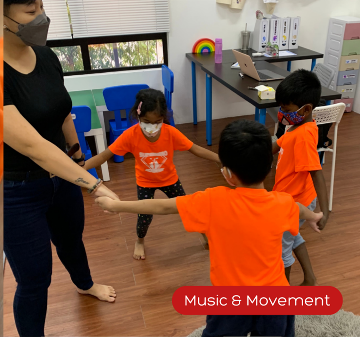
Music & Movement