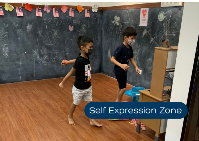
Self Expression Zone