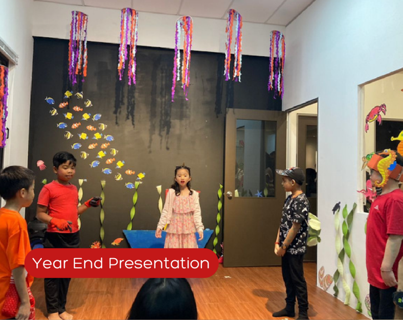
Year End Presentation