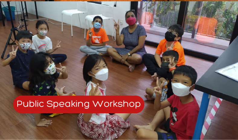
Public Speaking Workshop