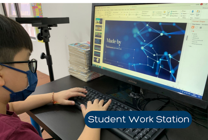
Student Work Station