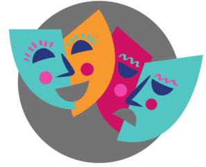
Speech & Drama