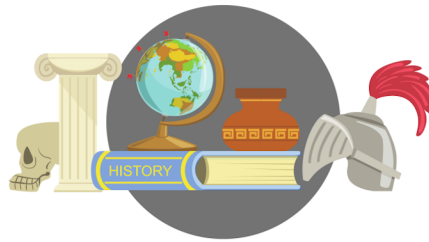
History & Geography