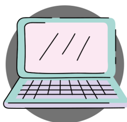
Coding & Basic Computing