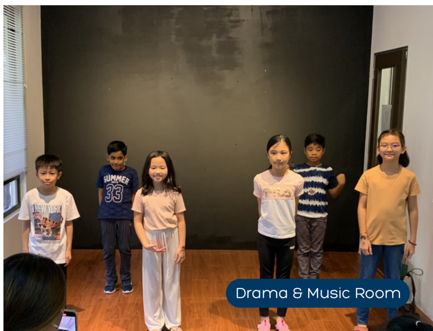
Drama & Music Room